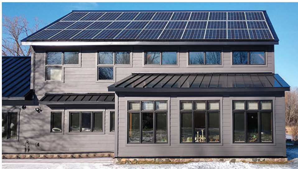
Rendering of Installation with Traditional Panels