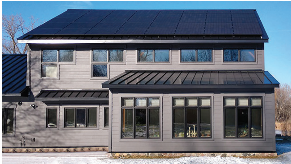
Actual Solaria PowerXT Installation

With 20% more energy per square meter than traditional solar panels, Solaria's advanced PowerXT ® panels generate maximum power in minimum space.